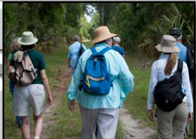
Nature Journaling Workshop - Nature journaling workshop participants head out to choose their spot to sit, observe, and write.