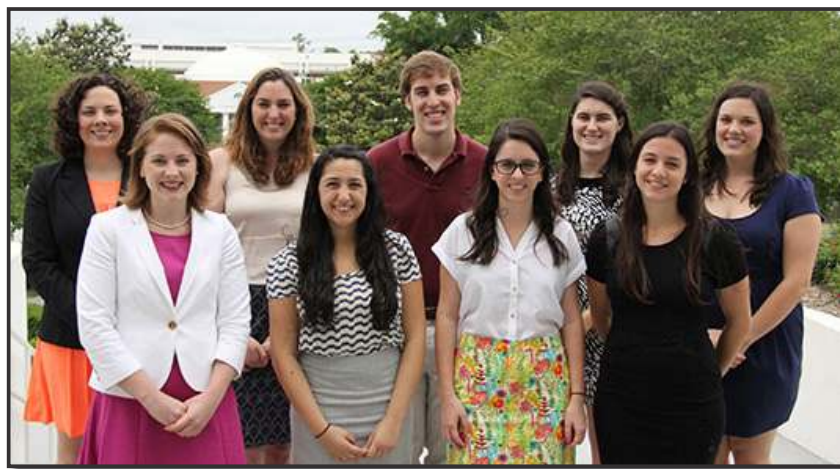
2013-2014 Environmental Law Society