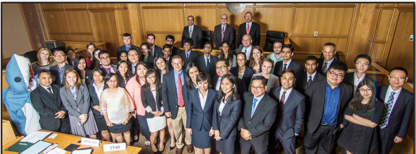
Participants, coaches, and competition judges after the championship round at the International Finals of Stetson's International Environmental Moot Court Competition.