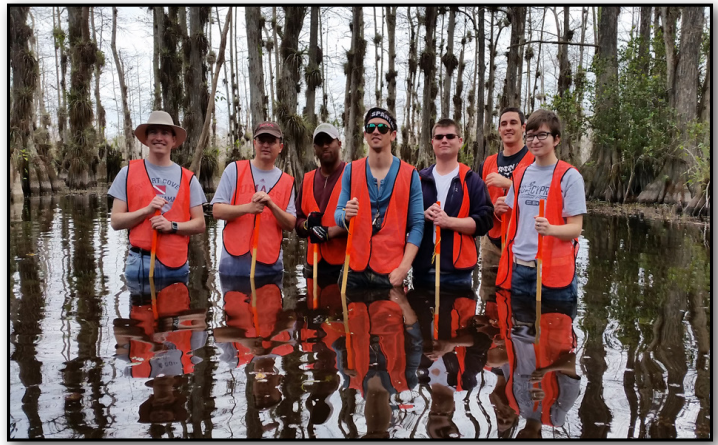
Ramsar course students on swampwalk in Big Cypress National Preserve.